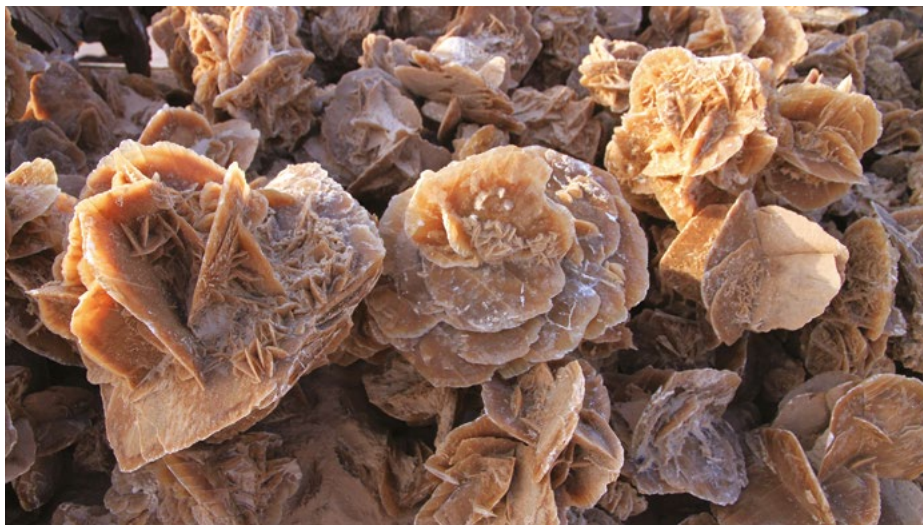
Geologic wonder. A rose-like formation of crystal clusters formed by precipitation in sandy arid regions, the Desert Rose is typically made-up of gypsum, baryte, celestine, and other minerals.

During our return to the truck, I heard a loud hiss that immediately made all my hair stand on end. I spent a year and a half as an intern (aka field grunt) in the oil fields and I learned that when you hear