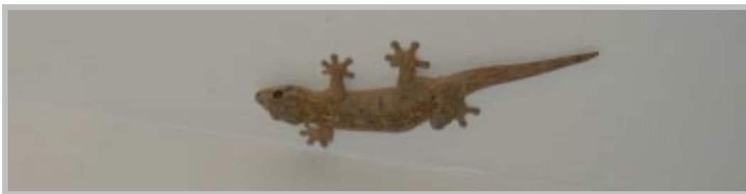
A ceiling-walking gecko on site at the Bouillante geothermal plant, Guadeloupe